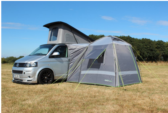
OUTHOUSE HANDI XL